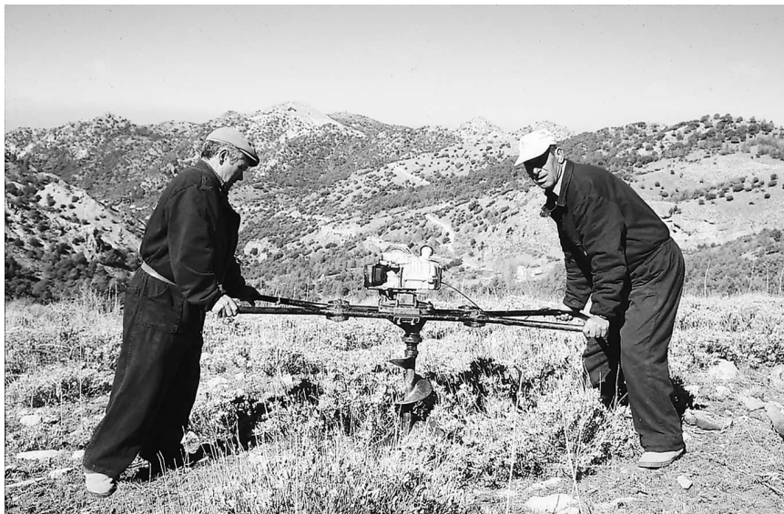
Figure 1. Workers digging holes for planting under the canopy of Salvia oxyodon (microhabitat Salvia in the text).

The pine seedlings used in the experiment came from a nursery located at 1,600 m a.s.l. in the Sierra Nevada (Soportújar, Granada), were grown from seeds collected from local populations of the two species, and were 2 years old. The black pine seedlings were grown