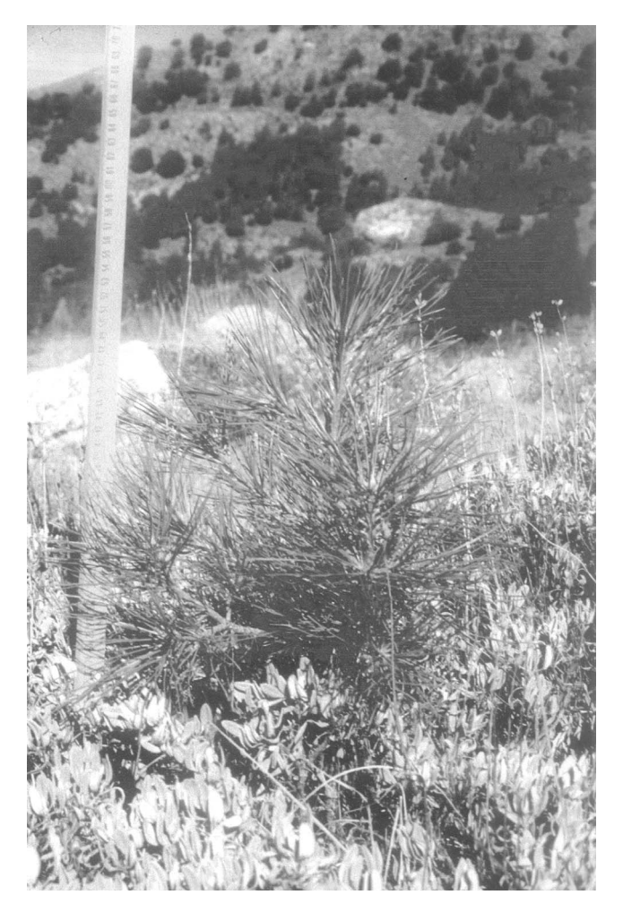
Figure 3. A sapling of Pinus nigra outgrowing Salvia lavandulifolia 4 years after planting.

impact of the reforestation, helping create spatially nonuniform and more diverse stands that are more resistant to pathogens, herbivores, and climatic hazards (Watt 1992; Schönenberger 2001; Hódar et al. 2003). This approach also largely avoids the problems of erosion caused by traditional, more aggressive techniques that eliminate the shrub cover using heavy machinery (García-Salmerón 1995; García-Latorre 1998; Linares et al. 2002; Pardini et al. 2003). These advantages are particularly relevant in protected areas where conservation and minimization of impact are a major priority or in mountain areas with complex orography.